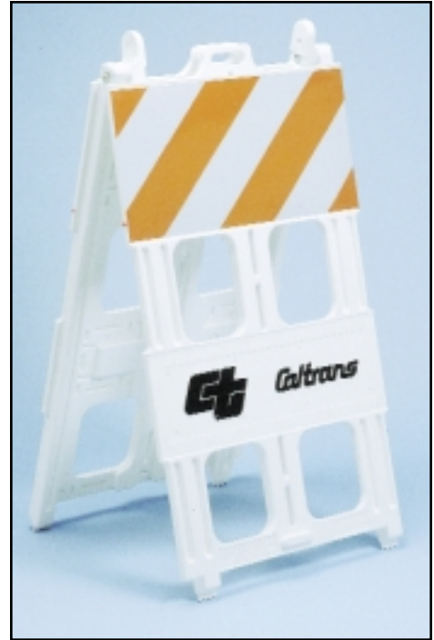
Sturdy, cross-member reinforced design with holes and slots for easy sign attachment.